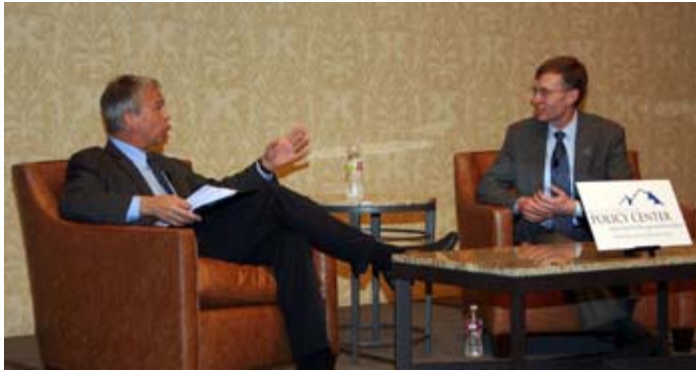
Panel 2: The Impact of HC Reform on WA State: